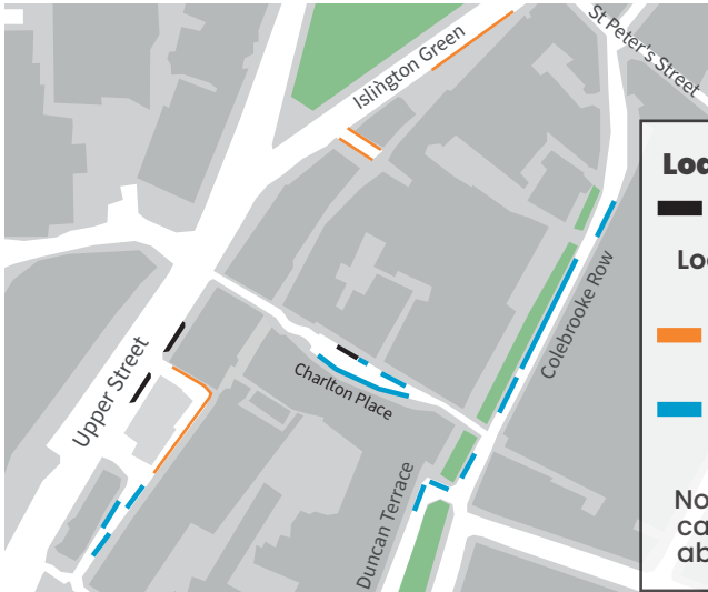
Map 2: Loading bays around Camden Passage