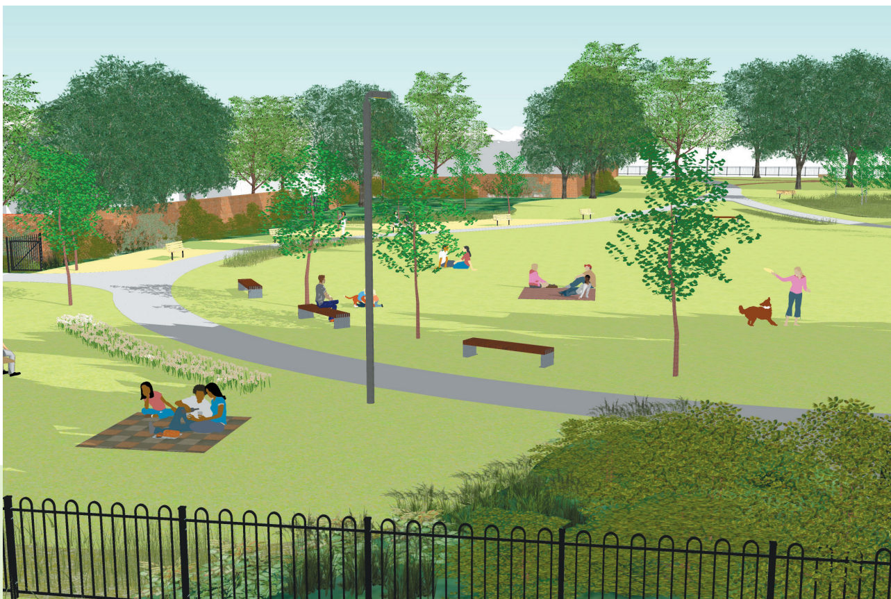
View looking east toward Barnsbury Road. A new large flat area of grass will be created for leisure activities and informal sport. New trees will be planted and there will be new seating. The new entrance at Sheen Grove can be seen to the left of the image.

At the centre of the park there will also be a new community hub building with a multi-use space which will provide for the existing One o'clock club.