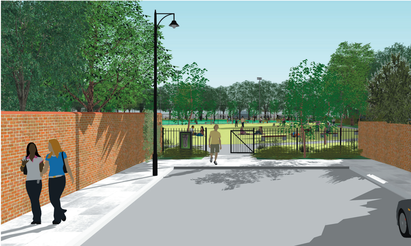
How the new proposed entrance at Sheen Grove could look with a simple level entrance and improved sightlines into the park and the large area of grass.

The new building will have accessible changing rooms and toilets, and the park keeper's office.