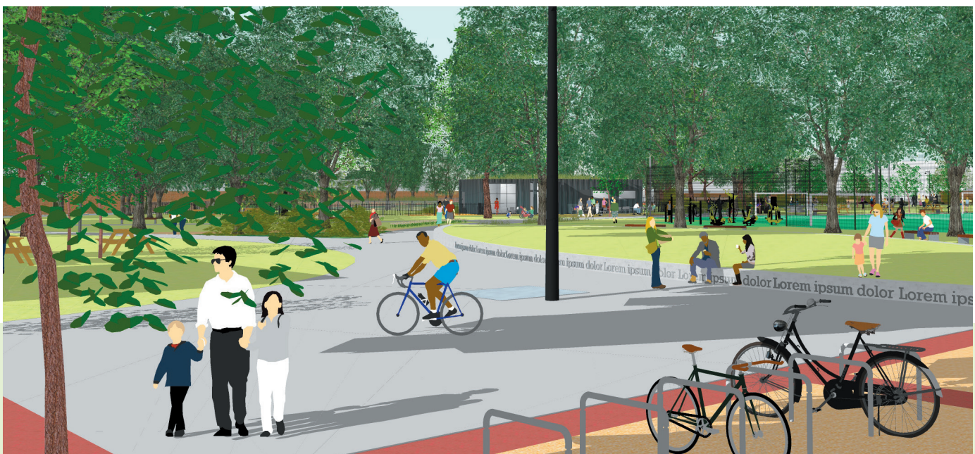
Improved surfacing and bike parking with a new levelled grass area and south facing seating, creating a meeting area.