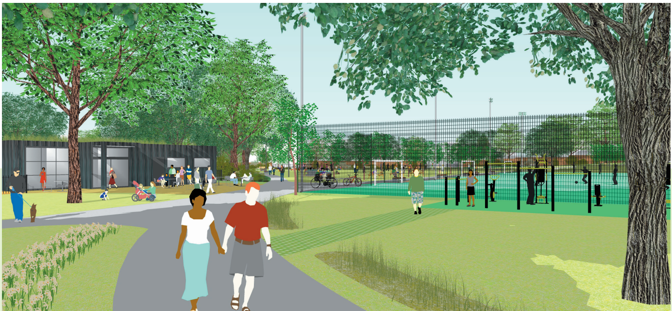
Looking north toward the new 3G 9 v 9 football pitch with the Community Hub Building and an area for outdoor fitness. Bulb planting and wildflower planting will add colour and interest.

When we have completed talking to key stakeholders and the public to get feedback on the changes we will consider the feedback and update our plans. We will submit the plans for planning approval in late summer 2021 with works starting in spring 2022.