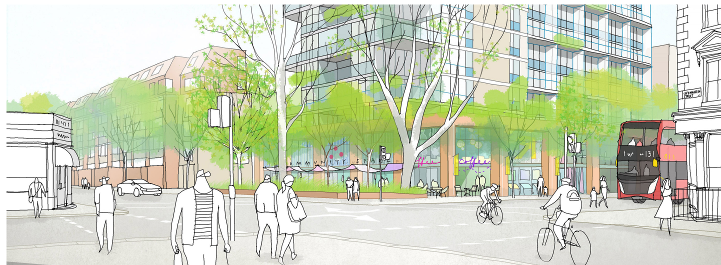
1 View from corner of Caledonian Road and Copenhagen Street looking onto the new two storey ground floor extension of Orkney House with new improved community facilities and commercial/retail spaces.