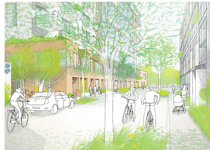
3 View looking south along the new mews street east of Orkney House. Orkney House garages converted into new homes turning this access road into a widely used and active traditional mews street.