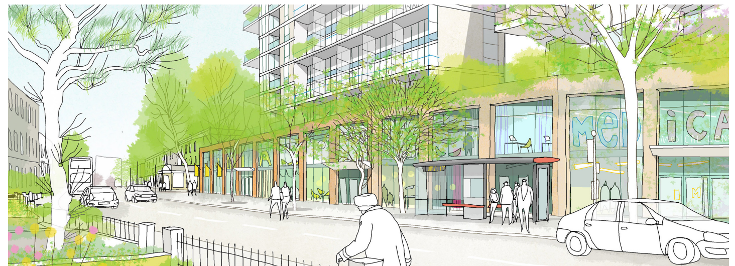
4 View from Caledonian Road of the two storey ground floor extension of Orkney House. There is an opportunity to provide new improved community facilities and new retail and commercial spaces.