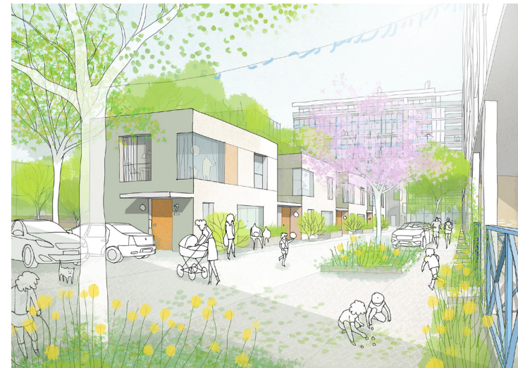
2 View of the proposed family homes at back of Dunoon House looking towards Orkney House. Back street is turned into a well-used and attractive traditional street.