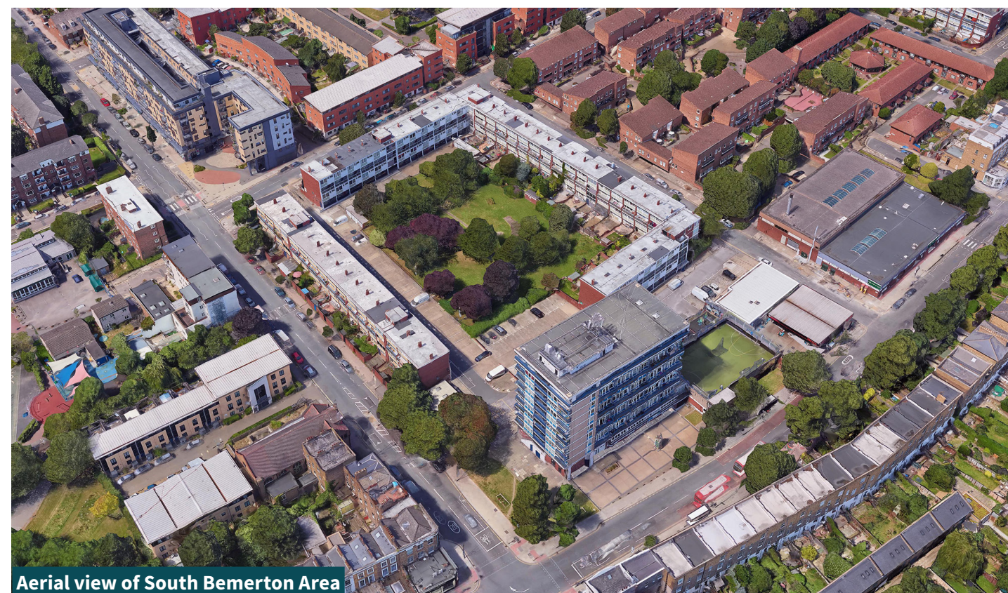
Aerial view of South Bemerton Area

This booklet sets out our early ideas. No decisions have been made yet because we want to hear your thoughts.