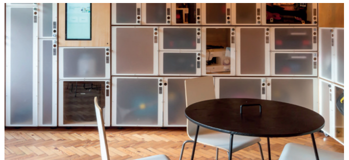
Equipment lending library